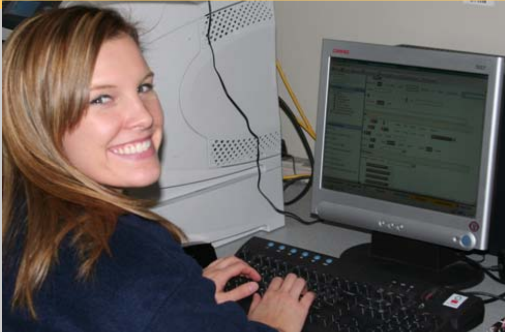
Conway Regional Medical Center; users of OnRecord